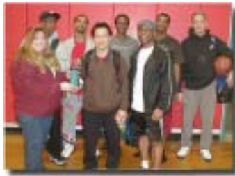
Shotcallers 2 nd Place AB Division

Congratulations to team Just Playas Six Time AB Division Champions!