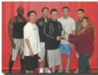
Three 1 st Place C Division