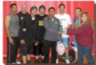
Cinnaballers 2 nd Place C Division