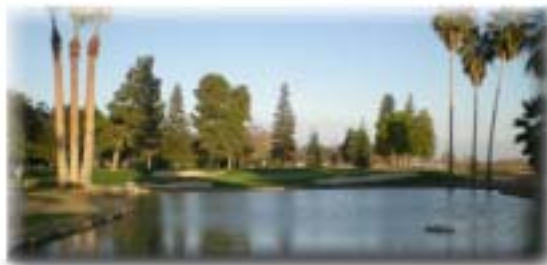
Belmont Country Club

INCLUDES: Green Fee, Cart, Range Balls, Tee Prizes and Contests