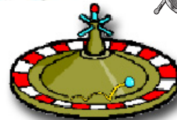
DON'T FORGET OUR "FAMOUS" SALAMI WHEEL!!

FROM HWY 99 Take Armstrong Road Exit Go West to Micke Grove Road Turn left to Micke Grove Park